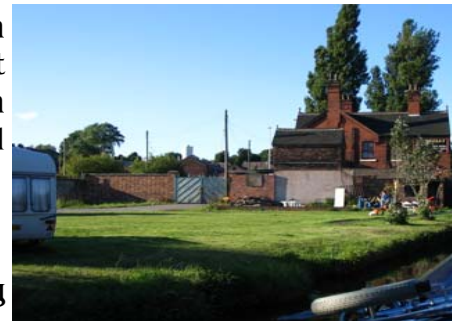
The Foxley at Milton

Lazy Days is home from home, with central heating radiators throughout the boat, hot water, macerator flush toilets, all cooking utensils supplied and bedding and towels for your adventure. We also supply a complimentary Holiday Pack by request, please tick the Booking Form if you require a pack for your holiday,