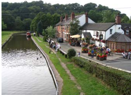
The Hollybush at Denford

Lazy Days will be fully equipped for your adventure. Everything from water (Lazy Days has a stainless steel water tank which holds 600 litres of clean drinking water); to fuel. You will be supplied with enough diesel for your cruise and then some. All you need to bring is yourselves, and food—unless you decide to sample all the food and drink from the many canal side pubs and restaurants—remember you are on holiday.