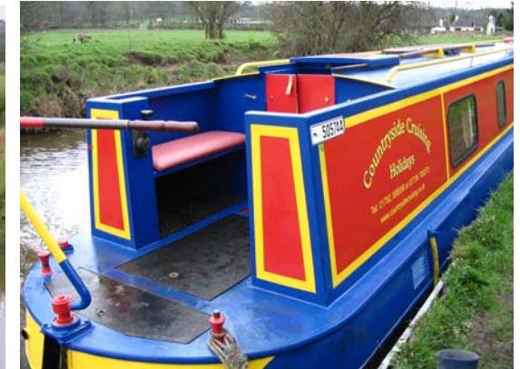
Holiday Brochure 2006

Lazy Days has a semi-trad stern which provides comfortable seating for passengers at the stern of the boat and additional safety for non-swimmers and children